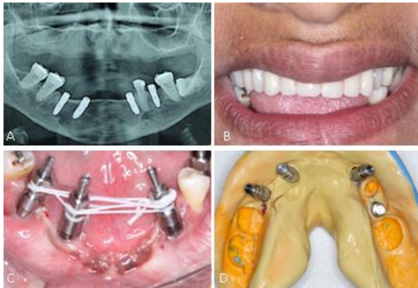
Fig. 2 - A: Panoramic Radiograph with implants installed. B: With the old complete denture the smile was unsatisfactory. C: Abutments and transfers. Subsequently the transfers were united with the acrylic resin (Duralay, Reliance Dental Mfg. Co., Chicago, USA). D: Addition silicone mold. Great difficulty was experienced during the technique.

A plastic tray was tried-in, cut and the transfers of the open tray were adapted on the abutments (Fig. 2, C). Using addition silicone (Elite, Zhermack, S.p.A., Italy) the impression was made, following the manufacturer's recommendations (Fig. 2, D).