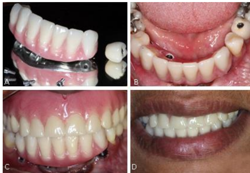
Fig. 3 – A: Implant-supported prostheses. B: View of the mandibular arch with the implant-supported prostheses . C: Prostheses installed. D: Smile.

The wax trial CD, metal framework with the acrylic teeth and posterior metal structure were installed and adjusted. The radiography showed a great adaptation between the metal structures and the abutments of the implants. The occlusion was adjusted. Thus, the prostheses were finished in the laboratory (Fig. 3, A). The dental prostheses were installed in the oral cavity (Fig. 3, B, C and D). The occlusion was adjusted. The patient was referred after a time to the surgery clinic for extraction of the molar retained in the mandible. After approximately 5 years of tumor removal, there was no recurrence of the lesion. In addition, there were no signs of peri-implant and/or periodontal diseases, evidencing the success of the treatment.